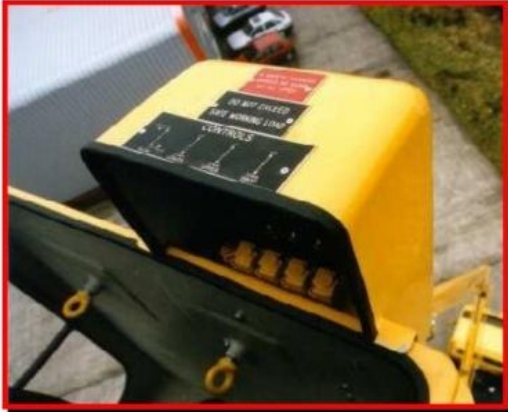
Cage hydraulic controls, showing the 2 x Safety Harness anchor points for the Operators