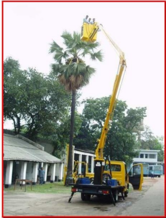
View from the cage showing the third boom and dual levelling arms